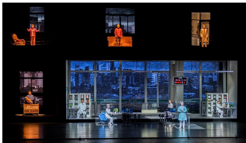
Figure 8: A scene from the world premiere of the opera “An angel's Diary at Qintai grand theatre Wuhan on 17.10.2020

One week later, another even more gigantic work, a two and half hours opera in two acts – “An Angel’s Diary” is world premiered at Qintai Grand Theatre, Wuhan! An absolute audio and visual impact!