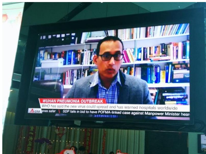
Figure 1: Picture taken in the lobby of our Hotel in Singapore on 16.01.2020.

When we arrived in Singapore, we saw astonishing TV news in the Hotel lobby, headline was "Wuhan pneumonia outbreak"! It was reported that in Thailand, Japan and South Korea there are some first cases of a very dangerous corona virus infection and people died of it!