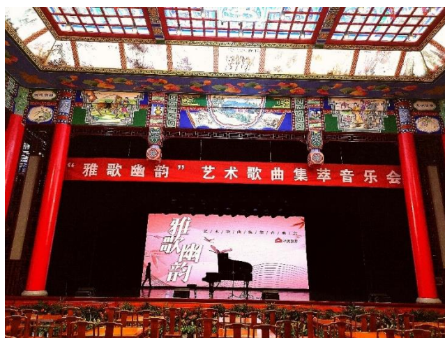
Figure 5: The stage at Tanghu theatre in a very Chinese style.