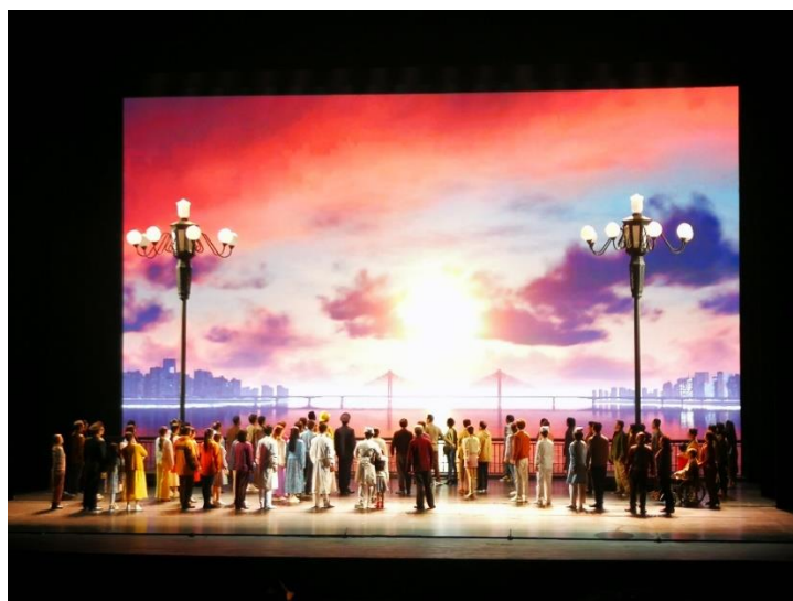
Figure 10: A closing scene from the world premiere of the opera “An angel’s Diary at Qintai grand theatre Wuhan on 17.10.2020.

Where is the angel ‘s place?天使在何方? Who has ever seen its face?谁曾见过天使的模样。 That you took my hands 只因你拉住我的手, Like the spring’ s wings 像春风的翅膀, The withered dreams 让凋零的梦想, Rebuild flying streams 从此重新飞翔。 Through the sorrow in our minds 穿越心的忧伤, To the spring warmth and flowers of its kind.去往春暖花开的远方。