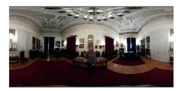
Figure 3: Capture of the professional guide presenting the room [F3]

Visitors can explore the room physically by moving their heads and the audio experience is directional. For the case of distance visiting, a specific point outside the building has been chosen and by scanning on it with a mobile device it shows the option of interactive guidance. In that case someone can virtually visit the room while being on the outside of the building. Finally, issues of usability and aesthetics have also been taken into strong consideration, as those kinds of applications apply to wide audiences with a wide range of abilities [see 25] and need to be relevantly adjusted.