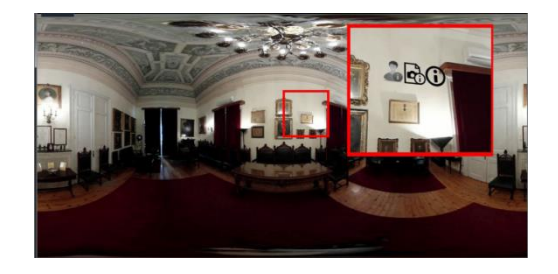
Figure 2: 360° video capture of the Mayor's office showing a Pol [F2]

The relevant documentation (photos, texts, audio and videos) was imbedded at the points of interest that had been marked with special graphics created for the case-study and the system was finally competed with the addition of interaction with the points of interest using UNITY 3D game development application. When a visitor is looking a point of interest, which have been signed with graphics, the access to extended information is presented. The information is either a short presentation, for example a guided tour of the room, photo galleries or other type of multimedia/content descriptive information.