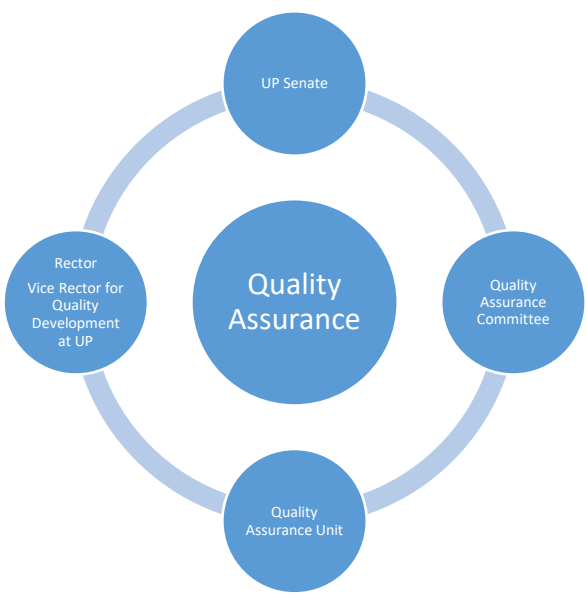
Figure 2. Quality Assurance System

The higher authority in the reporting structure at the University of Prishtina "Hasan Prishtina" for Quality issues is University Senate. In central level of University exists Quality Assurance Committee. The Committee is a Sub-Committee which reports directly to the University Senate through the Vice-Rector for Quality Development<sup>17</sup>.